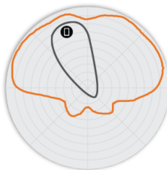
Figure 4. T750 2.4GHz Elevation Antenna Patterns