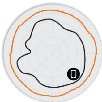
Figure 3. T750 5GHz Azimuth Antenna Patterns