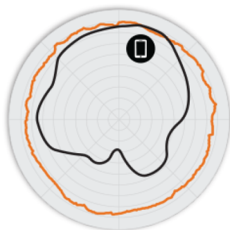
Figure 2. T750 2.4GHz Azimuth Antenna Patterns